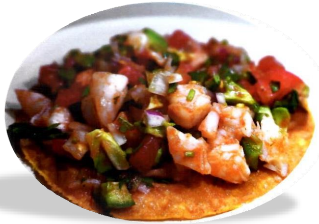
Tostada de Ceviche

One flat crunchy shell topped with shrimp, onion, tomato, cilantro, avocado slices and lime juice.