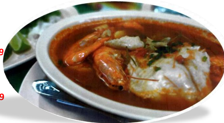
Sopa de Mariscos

Served with a side of onions, cilantro and lime.