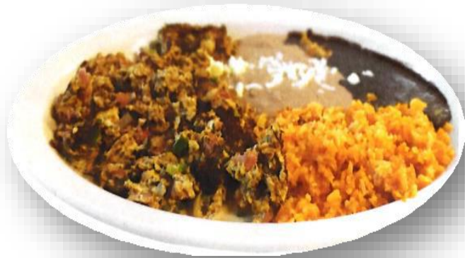
Huevos con Chorizo

Pulled beef served with rice, beans and tortillas.