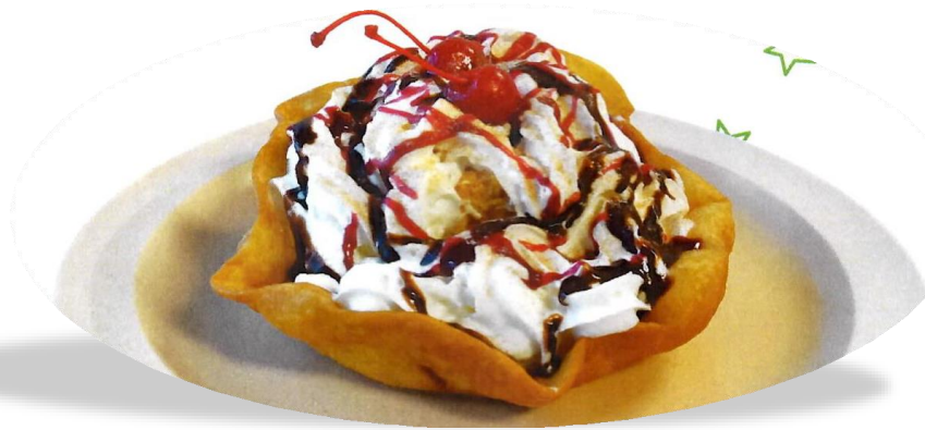
Fried ice Cream