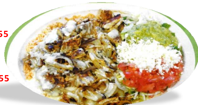
Arroz con pollo